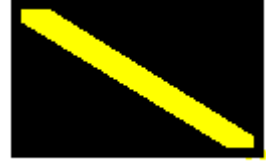
Bad Sportsmanship Flag