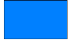
Light Blue Flag